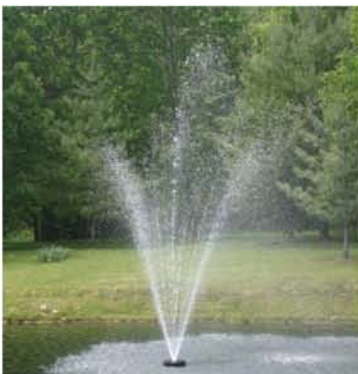
Water Trumpet - A symmetrical inverted bell shape