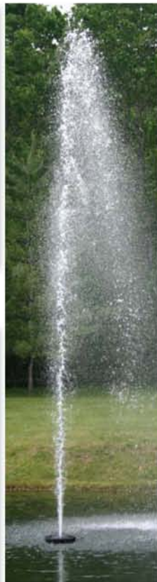
Sky Cannon - A dramatic single plume of water

Water Lily - An eye-catching combination spray