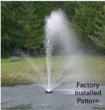
Factory Installed Pattern

Water Lily - An eye-catching combination spray