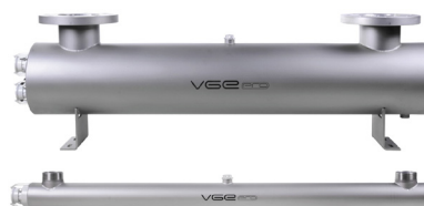
VGE PRO INOX