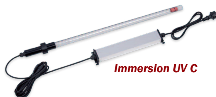
Immersion UV C