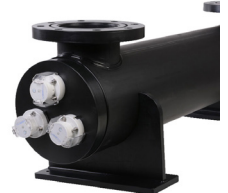
VGE PRO HDPE

For corrosive water / salt water applications